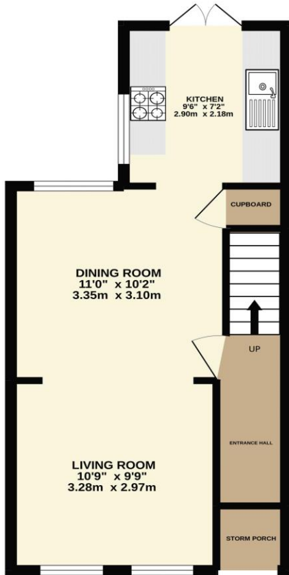
GROUND FLOOR 372 sq.ft. (34.6 sq.m.) approx.